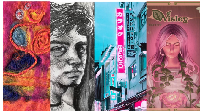
A Celebration of Art, Photography, Textiles, Graphics & Technology.