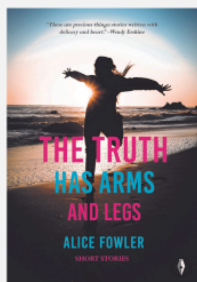
ALICE'S PUBLISHED SHORT STORY COLLECTION!