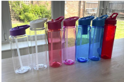
Transparent water beakers only!